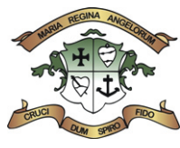
Loreto College Foxrock