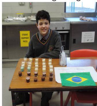
Food from around the world