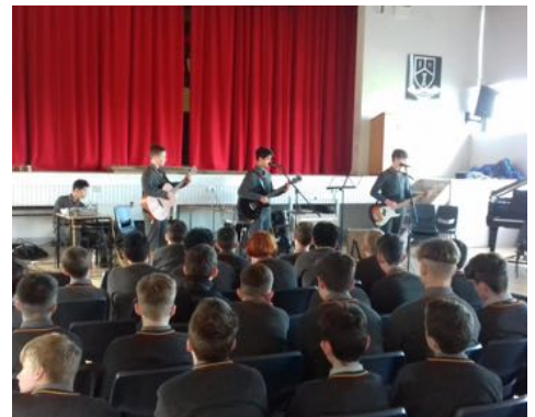
Junior Music Concert