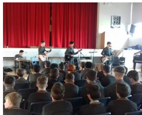
Junior Music Concert