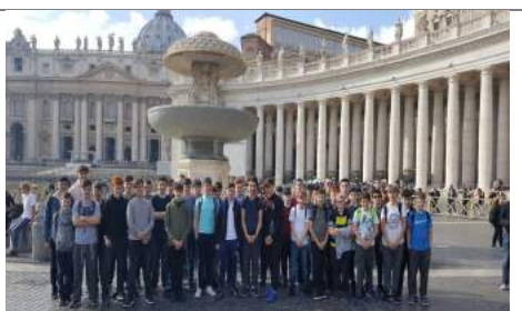
CBC in Rome