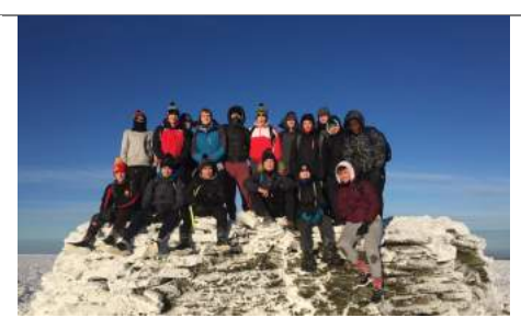
5<sup>th</sup> Year Geogrpahy climbed Lugnaquilla