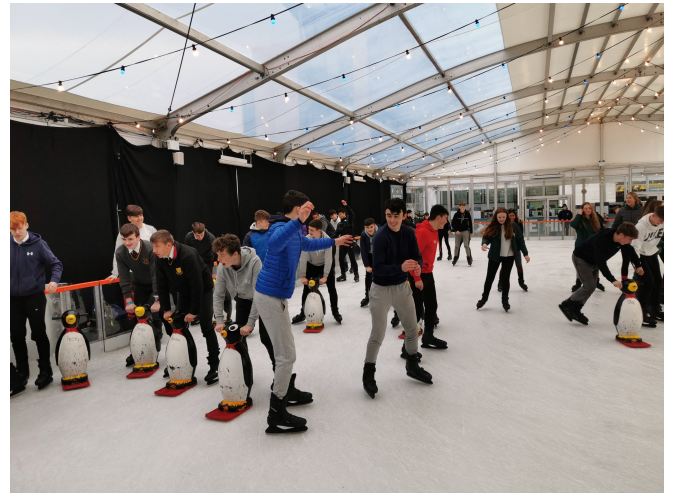
Some of the Transition Years getting to grips with skating at Dundrum on Ice.