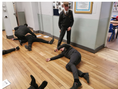
Our Transition Years have been working hard in their first aid module.