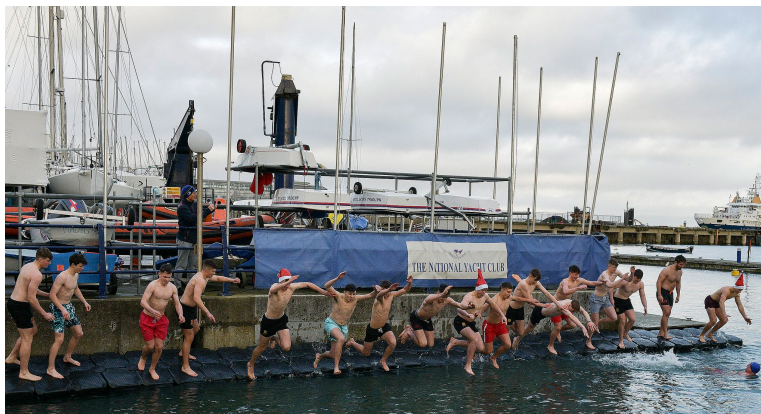
Our SCT took the plunge in aid of Our Lady's Children's Hospital, Crumlin. We also had a polar plunge in aid of our Zambia Immersion Project.