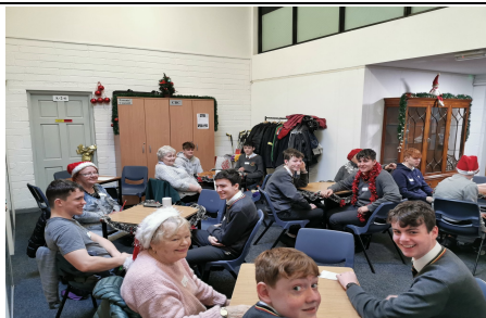
Some of our Transition Years ran a Table Quiz for some senior members of our local community.