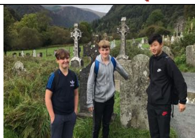
2nd year Retreat